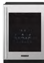
SKSUW2401P 24-Inch Undercounter Wine Refrigerator (Panel Ready*)

*Shown with optional stainless steel panels