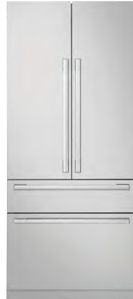
SKSFD3604P 36-Inch Built-In French Door Refrigerator (Panel Ready*)