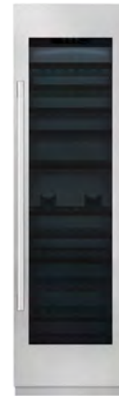
SKSCW241RP 24-Inch Integrated Column Wine Refrigerator (Panel Ready*)