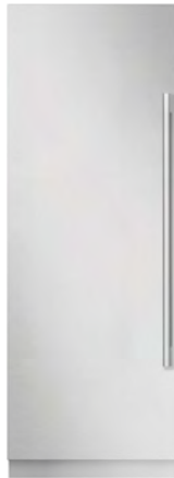
SKSCF3001P 30-Inch Integrated Column Freezer (Panel Ready*)