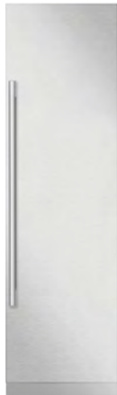
SKSCR2401P 24-Inch Integrated Column Refrigerator (Panel Ready*)