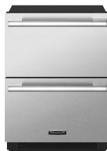
SKSUD2402P 24-Inch Undercounter Convertible Refrigerator / Freezer Drawers (Panel Ready*)

Our 24-inch undercounter models take preservation beyond the traditional kitchen space and into your favorite entertainment spots throughout the house.