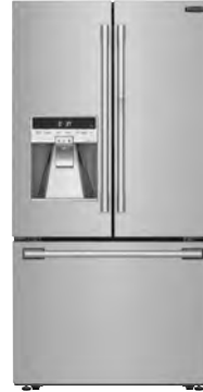
SKSFD3613S 36-Inch Counter-Depth French Door Refrigerator