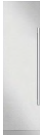
SKSCF2401P 24-Inch Integrated Column Freezer (Panel Ready*)