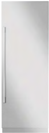
SKSCR3001P 30-Inch Integrated Column Refrigerator (Panel Ready*)